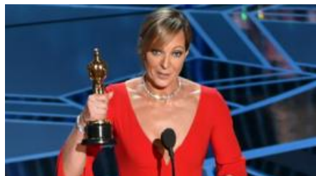
Oscars 2018: Who won and who lost out?