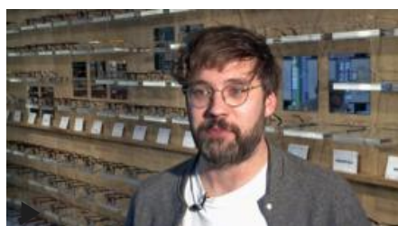
'Obsess about and understand your customers'