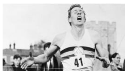
Gentleman amateur runner who achieved mile glory