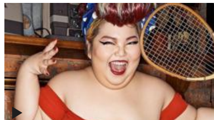
Being sexy at any size in Asia