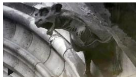
Notre-Dame: Cracks in the cathedral