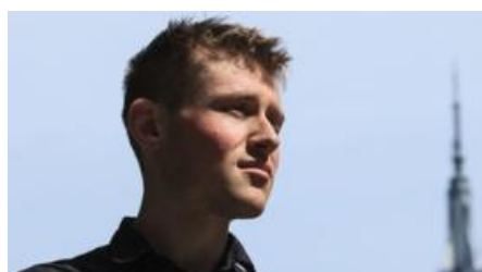
'I went undercover in the alt-right'