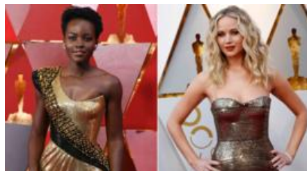
Metallic dresses and a leather harness on the red carpet